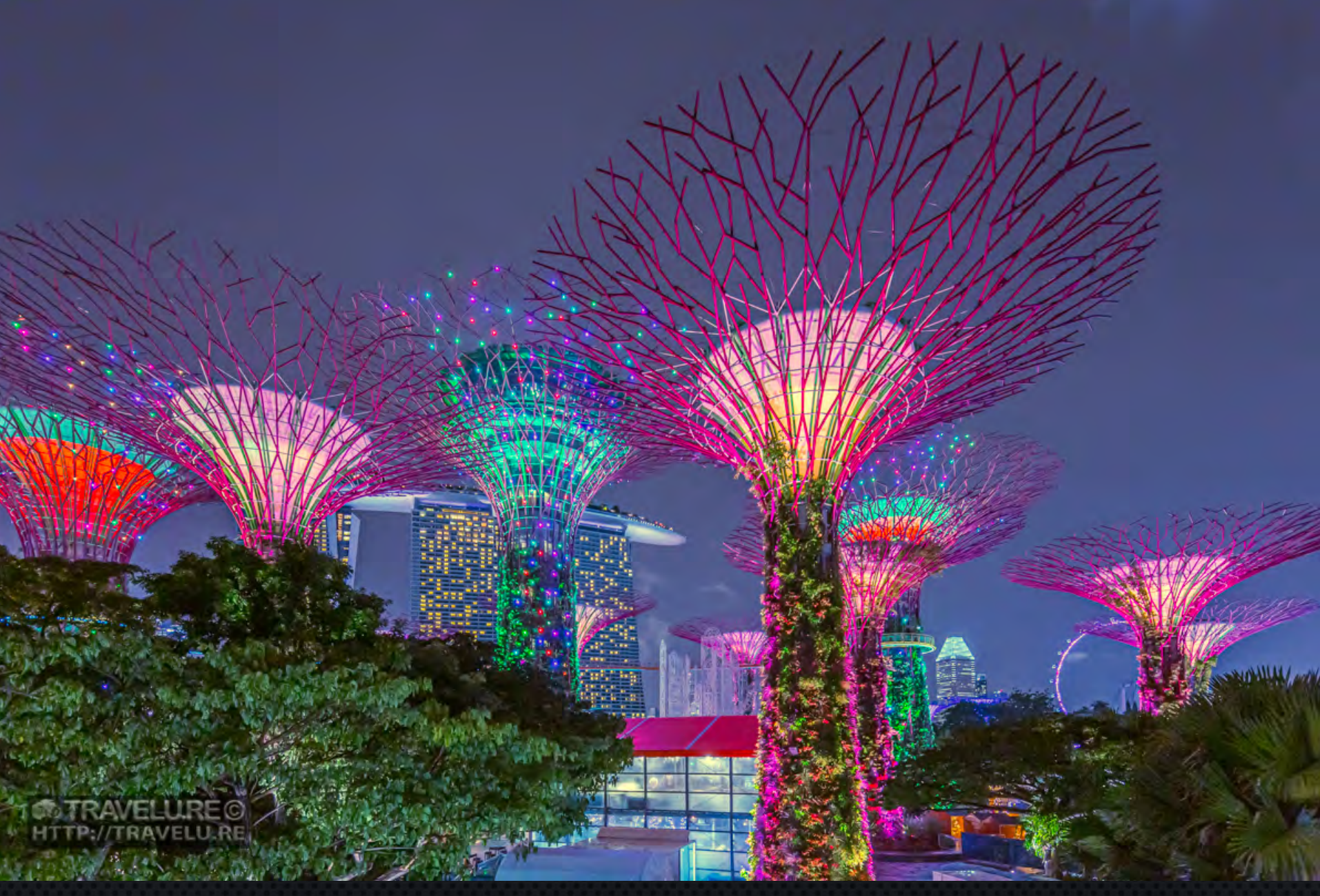
Super Tree Grove, Singapore, illuminated for Christmas during the evening sound & light show – Garden Rhapsody.