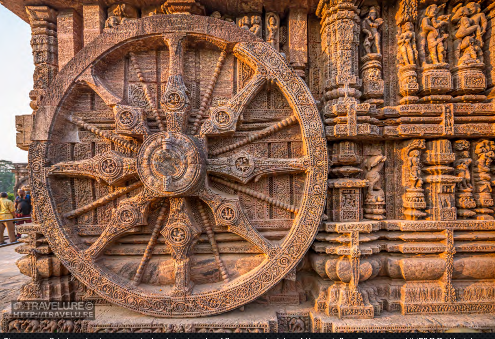
There are 24 stunningly-carved chariot wheels - 12 on each side of Konark Sun Temple, a UNESCO World Heritage Site.