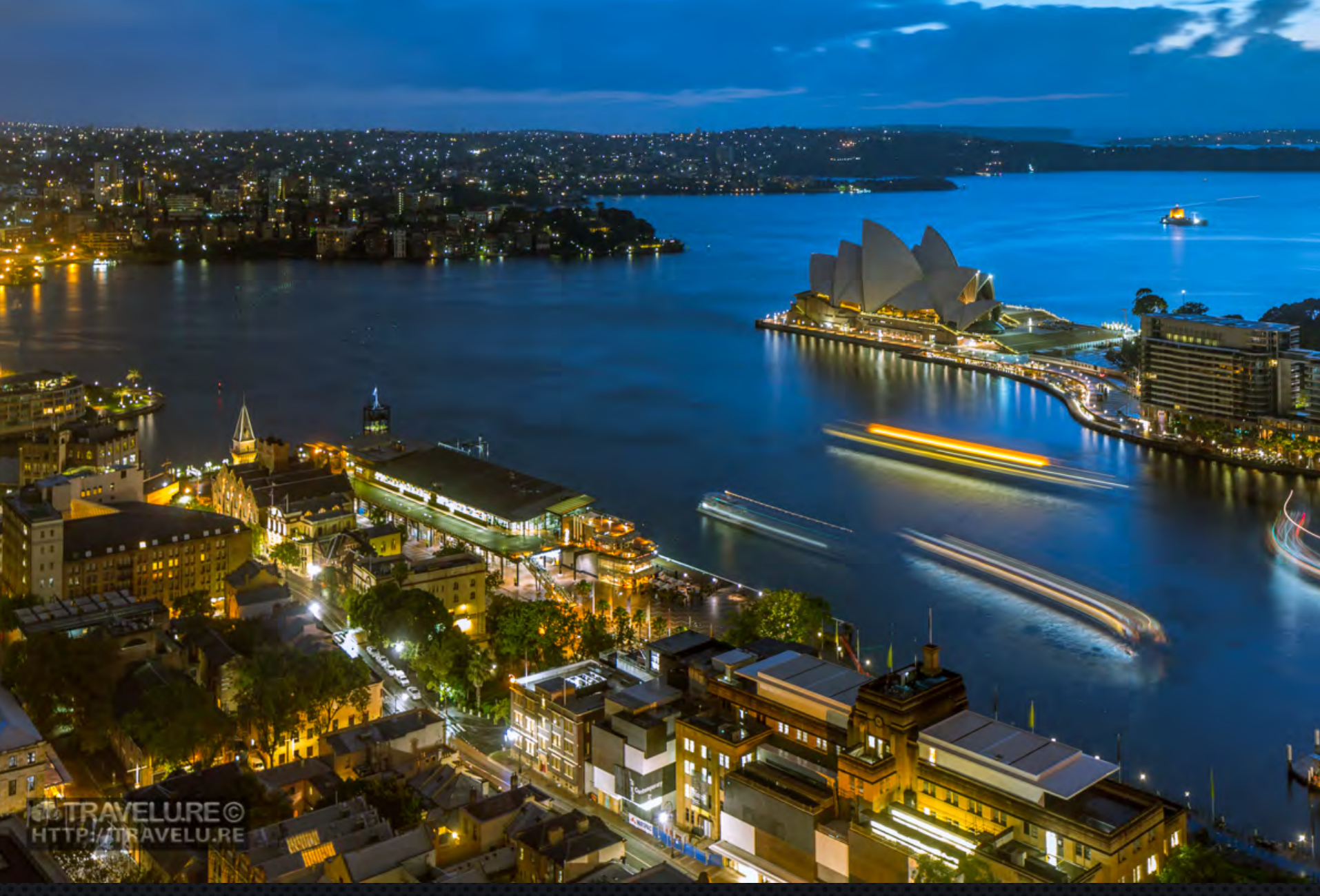
Sydney's Opera House at the blue hour. A UNESCO site, this structure single-handedly changed the image of an entire continent.